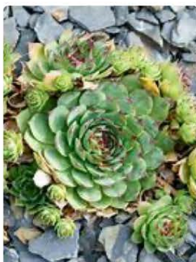
HEN & CHICKS