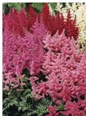
PURPLE CONE FLOWER