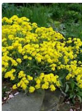
BASKET OF GOLD