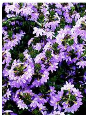
NEW WONDER SCAEVOLA