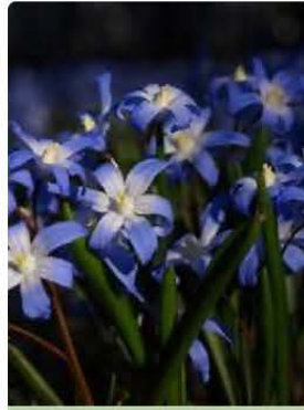
GLORY OF THE SNOW